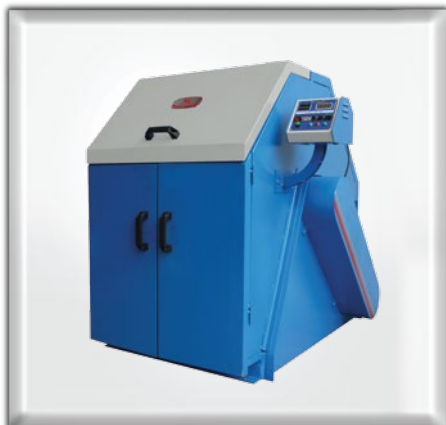
Closed Sound Proof Cabinet