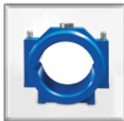
NL 2010 X / 004 - A 001