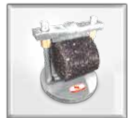
NL 2010 X / 004 - A 004