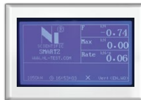
Main Screen Display