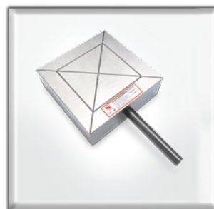
NL 4000 X / 001 - A005